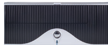
Power button with LED

300 W Power Supply One 6 cm fan and a reserved space for the second fan