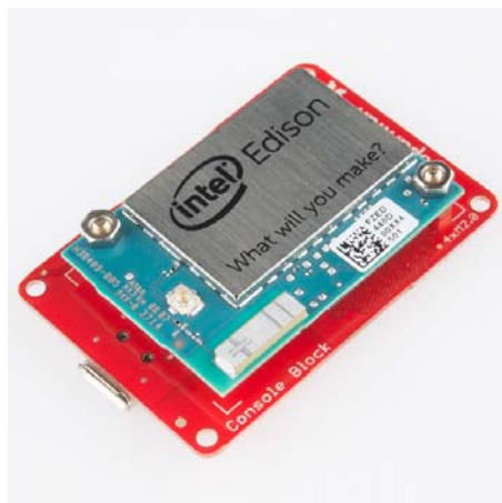
Console Block Installed

To use the console Block, attach an Intel Edison to the back of the board, or add it to your current stack. Blocks can be stacked without hardware, but it leaves the expansion connectors unprotected from mechanical stress.