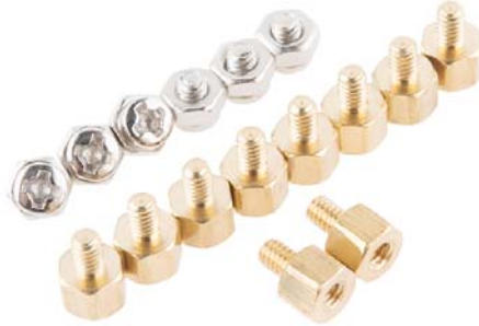
Intel Edison Hardware Pack