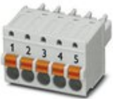
PCB connector, nominal cross section: 1.5 mm 2 , color: light gray, nominal current: 8 A, rated voltage (III/2): 160 V, contact surface: Tin, type of contact: Female connector, number of potentials: 5, Number of rows: 1, Number of positions per row: 5, number of connections: 5, product range: FK-MCP 1,5/..-ST, pitch: 3.81 mm, connection method: Push-in spring connection, conductor/PCB connection direction: 0 °, plug-in system: MINI COMBICON, Locking: without, mounting: without, type of packaging: packed in cardboard

Printed-circuit board connector - FK-MCP 1,5/ 5-ST-3,81GY35BD1-5 - 1015782