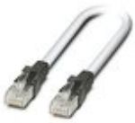
Patch cable, CAT5, assembled, 2 m

Patch cable - FL CAT5 PATCH 2,0 - 2832289