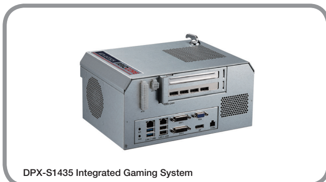
DPX-S1435 Integrated Gaming System