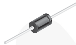
DO-41 (Plastic) COLOR BAND DENOTES CATHODE