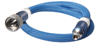
CASE STYLE: NE1922-2.1