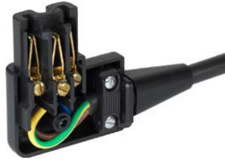
Example with assembled cable