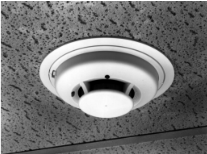
Figure 3. Adapter bracket covers previous detector footprints and flawed installations.