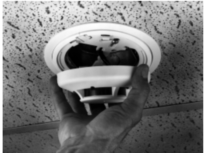
Figure 2. Install detector.