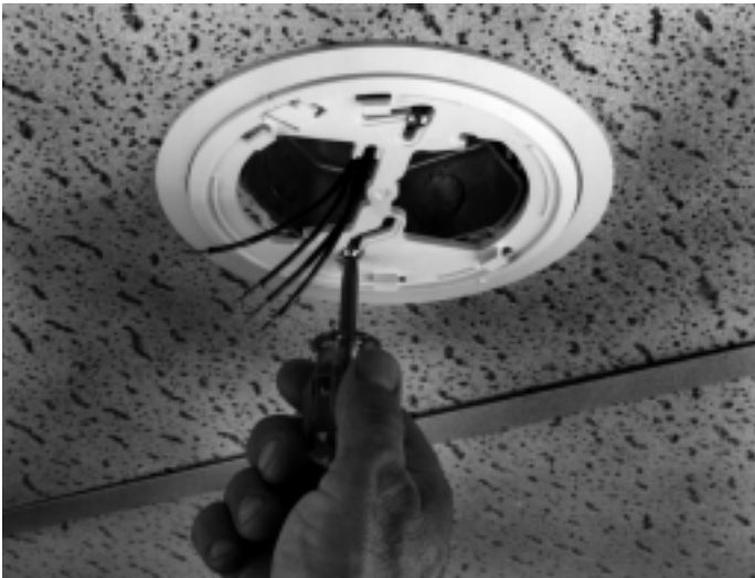
Figure 1. Install adapter bracket between ceiling and mounting bracket.