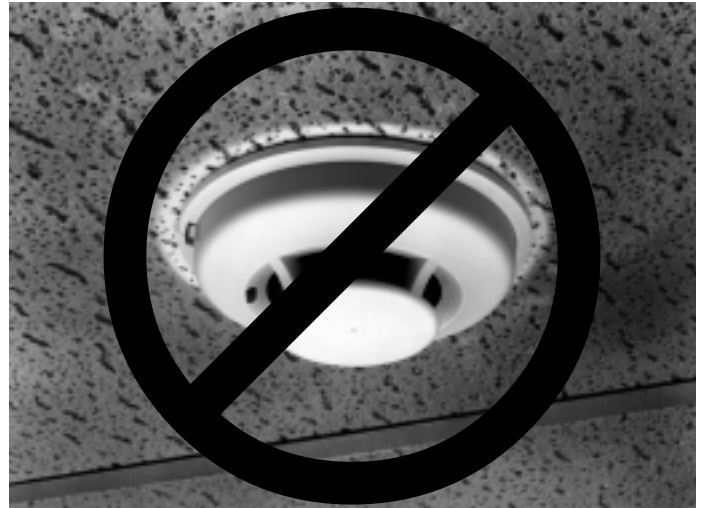
Figure 4. Detector without adapter bracket