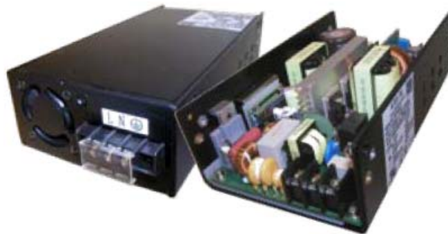
PSRL5016U3 Series: (U-Chassis): 7(L) x 4(W) x 2(H) inches. PSRL5016E3 Series: (Enclosed with built-in fan): 8(L) x 4(W) x 2(H) inches.