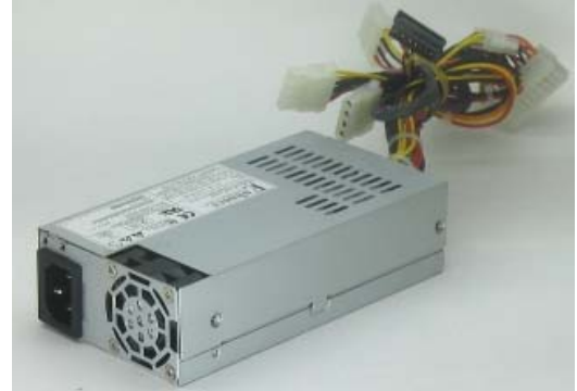
Dimension ( L x W x H ) : 150 x 81.5 x 40.5 mm