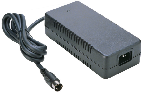
6.6" x 3.0" x 1.75"