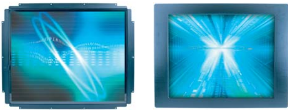
Open Frame Type