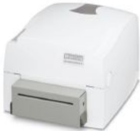
Cutter, for the THERMOMARK S1

Please be informed that the data shown in this PDF Document is generated from our Online Catalog. Please find the complete data in the user's documentation. Our General Terms of Use for Downloads are valid ( http://phoenixcontact.com/download )