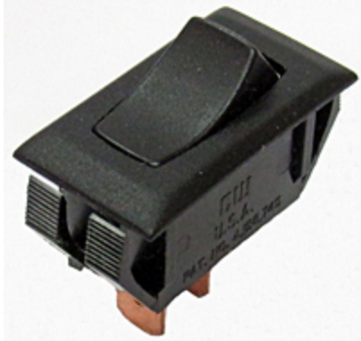
Item # GRS-2011B-2000, 2000 Series Momentary Full Size Rocker Switches

Email: info@cwind.com • Website: http://www.cwind.com