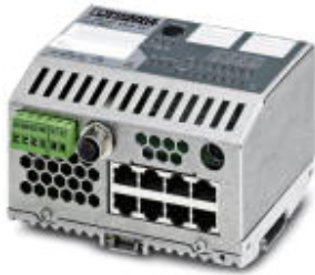
Ethernet Smart Managed Compact Switch with eight 10/100 Mbps RJ45 ports, PROFINET mode (default)

Please be informed that the data shown in this PDF Document is generated from our Online Catalog. Please find the complete data in the user's documentation. Our General Terms of Use for Downloads are valid ( http://phoenixcontact.com/download )