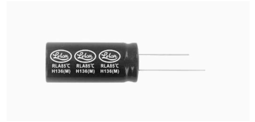
Sleeve & Marking Color: Orange & Black