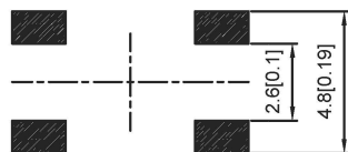
PCB Layout(pattern side)