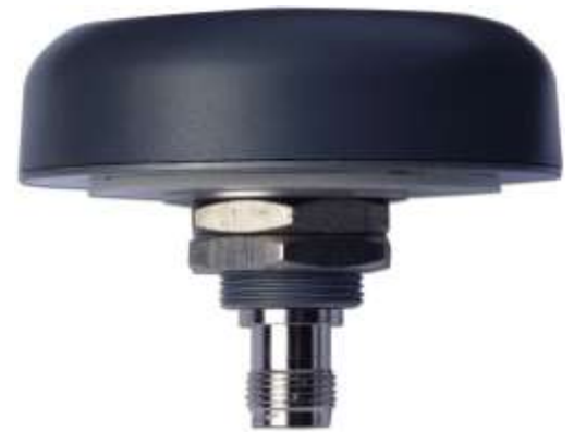
TW3100 Dimensions (mm)

The TW3100 is housed in a permanent mount industrial grade weather-proof enclosure. Two options for mounting are available: an L-bracket (P/N#23-0040-0) or pipe mount (P/N#23-0065-0).