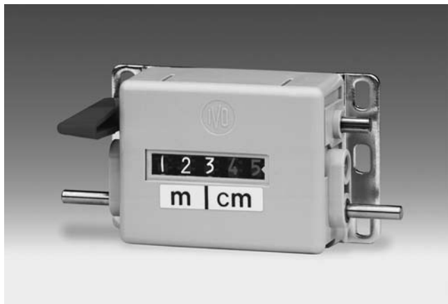
M 310.A - PTB Meter counter