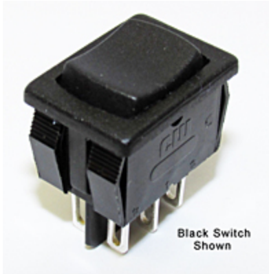
Black Switch Shown

Check Distributor Stock · Specifications · Materials · Operating Standards