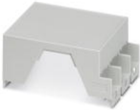
Component housing, length: 99 mm, Upper part, color: light gray, width: 67.5 mm, height: 38.5 mm

Please be informed that the data shown in this PDF Document is generated from our Online Catalog. Please find the complete data in the user's documentation. Our General Terms of Use for Downloads are valid ( http://phoenixcontact.com/download )