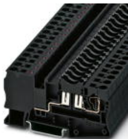
Fuse terminal block with LED for mounting on NS 35, for miniature circuit breakers, terminal width: 8.2 mm, color: Black

Please be informed that the data shown in this PDF Document is generated from our Online Catalog. Please find the complete data in the user's documentation. Our General Terms of Use for Downloads are valid ( http://phoenixcontact.com/download )