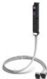
VIP VARIOFACE front adapter, with connected system cables for SMATIC S7-300, 2 x 8 channels can be connected, cable length: 1.5 m

Please be informed that the data shown in this PDF Document is generated from our Online Catalog. Please find the complete data in the user's documentation. Our General Terms of Use for Downloads are valid ( http://phoenixcontact.com/download )