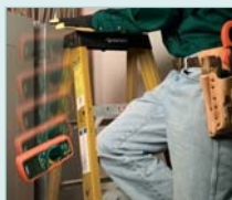
Drop-proof to 6 feet (2.9m)