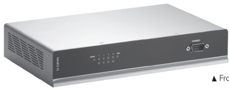
▲ Front view

Fanless Desktop Network Appliance Platform with Intel® Atom™ Processor N270 and 4 LANs