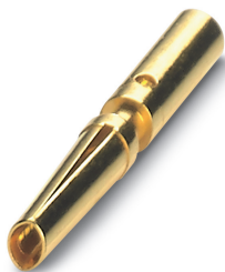
Crimp contact, turned, contact diameter: 0.8 mm, crimp range: 0.34 mm 2 ... 0.5 mm 2

Please be informed that the data shown in this PDF Document is generated from our Online Catalog. Please find the complete data in the user's documentation. Our General Terms of Use for Downloads are valid ( http://phoenixcontact.com/download )