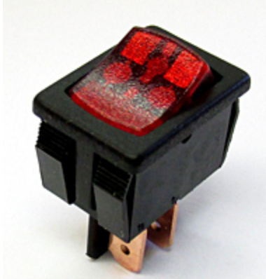
Item # GRL-4011-0015, 4000 Series Illuminated Miniature Rocker Switches

Email: info@cwind.com • Website: http://www.cwind.com