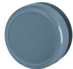
FB Bell Grey