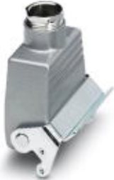
Coupling housing, with single locking latch, height 48 mm, with screw connection, 1x Pg16

Please be informed that the data shown in this PDF Document is generated from our Online Catalog. Please find the complete data in the user's documentation. Our General Terms of Use for Downloads are valid ( http://phoenixcontact.com/download )