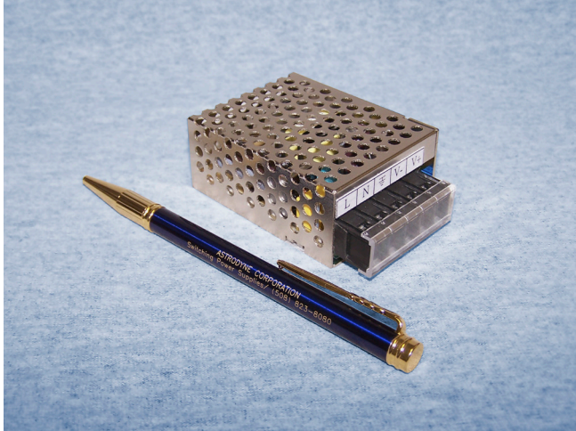
2.59"W x 1.98"L x 1.1"H