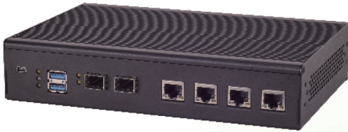
Images are for reference only. See ordering information for SKU details.

Desktop Network Appliance Powered by Intel® Atom® C3000 (Denverton) CPU