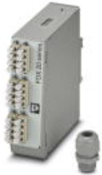
DIN rail splice box, fully mounted ready to splice, for 12x LC duplex (OM4)

Please be informed that the data shown in this PDF Document is generated from our Online Catalog. Please find the complete data in the user's documentation. Our General Terms of Use for Downloads are valid ( http://phoenixcontact.com/download )