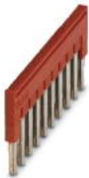
Plug-in bridge, pitch: 5.2 mm, length: 22.7 mm, width: 50.6 mm, number of positions: 10, color: red

Please be informed that the data shown in this PDF Document is generated from our Online Catalog. Please find the complete data in the user's documentation. Our General Terms of Use for Downloads are valid ( http://phoenixcontact.com/download )