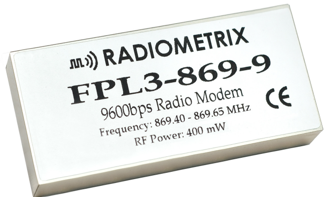
Figure 1: FPL3-866-9

The FPL3 is a 9600baud half-duplex multi channel OEM radio modem with a power output of 400mW. FPL3 operates in the European 500mW 869.40 - 869.65MHz non-specific SRD sub-band. It is also available in the Indian licence free 865 - 867MHz band (General telemetry and RFID).