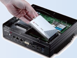
2. One screw removable storage bracket