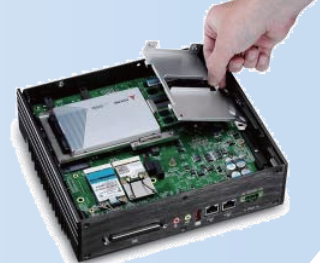
3. Flexible memory expansion slots