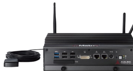
MXE-5300 with Antenna