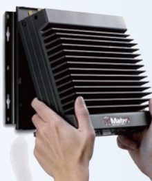
1. Ready-to-deploy wall mount kit