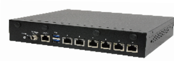
Images are for reference only. See ordering information for SKU details.

Desktop Network Appliance Powered by Intel® Atom® C3000 (Denverton/Denverton-R) CPU