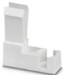
Switching lock, for disconnect slides, length: 12 mm, width: 8.2 mm, color: white

Please be informed that the data shown in this PDF Document is generated from our Online Catalog. Please find the complete data in the user's documentation. Our General Terms of Use for Downloads are valid ( http://phoenixcontact.com/download )