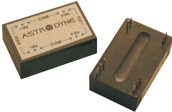
Unit measures 0.8"W x 1.25"L x 0.4"H