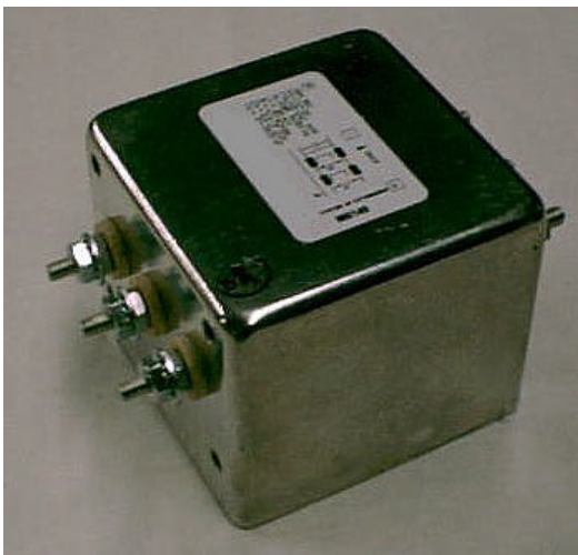
INSERTION LOSS 1306 SERIES