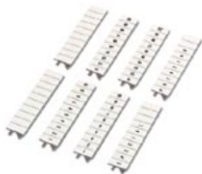
Zack marker strip, 10-section, horizontally labeled with the identical number: 5, white, width: 5 mm

Please be informed that the data shown in this PDF Document is generated from our Online Catalog. Please find the complete data in the user's documentation. Our General Terms of Use for Downloads are valid ( http://phoenixcontact.com/download )