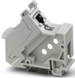
Patch panel, RJ45, DIN rail mounting, IP20, 1 slot, IDC connection, CAT6

Please be informed that the data shown in this PDF Document is generated from our Online Catalog. Please find the complete data in the user's documentation. Our General Terms of Use for Downloads are valid ( http://download.phoenixcontact.com )