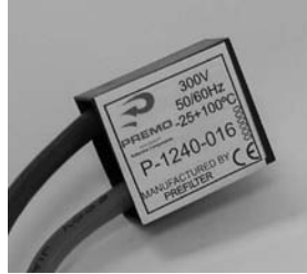
P-1240-016 (Single Phase)