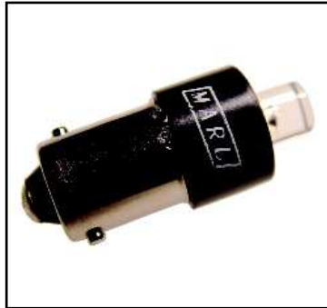
214 SERIES PACK QUANTITY = 20 PIECES