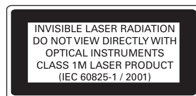
Figure 2. Laser classification label for Class 1M

All laser sources listed above are classified as Class 1M according to IEC 60825 1 (2001). All laser sources comply with 21 CFR 1040.10 except for deviations pursuant to Laser Notice No. 50, dated 2001-July-26.