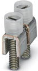
Fixed bridge, Number of positions: 2, Color: silver

Please be informed that the data shown in this PDF Document is generated from our Online Catalog. Please find the complete data in the user's documentation. Our General Terms of Use for Downloads are valid ( http://download.phoenixcontact.com )