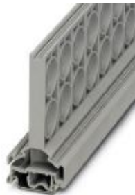
Empty enclosure, for mounting on NS 32 or NS 35/7.5, double-level

Please be informed that the data shown in this PDF Document is generated from our Online Catalog. Please find the complete data in the user's documentation. Our General Terms of Use for Downloads are valid ( http://phoenixcontact.com/download )