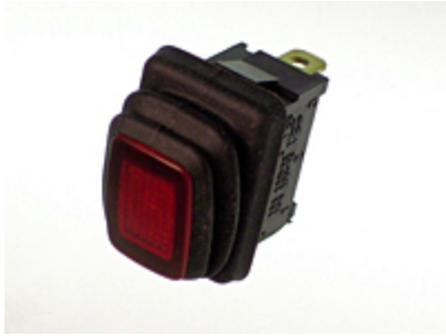
Item # GRB066C8SERIES, GRB Series Miniature Sealed Rocker Switches

Email: info@cwind.com • Website: http://www.cwind.com