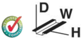
Figure shows PLC-BSC-120UC/21-21/SO46 version

14 mm PLC basic terminal block for high continuous currents with spring-cage connection, without relay or solid-state relay, for mounting on DIN rail NS 35/7,5, 1 PDT, input voltage 24 V DC