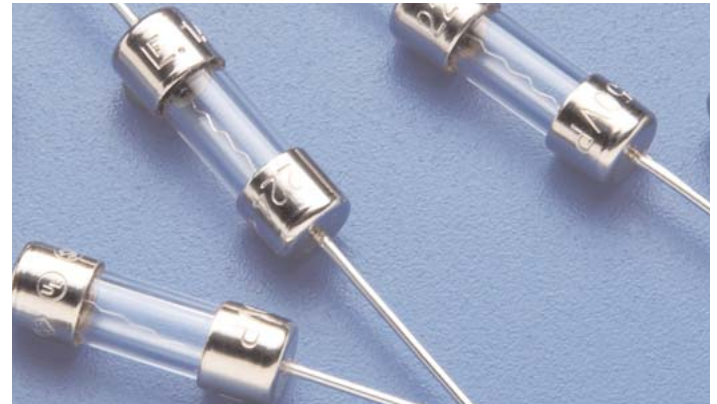
2206 000P Series

Wave solder- 500°F(260°C), 3 seconds Max. Reflow solder- Not recommended