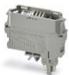
Component connector, specifically for holding the SKN 2,5 diode, nominal current: 10 A, length: 41.2 mm, width: 12.3 mm, height: 37.5 mm, number of positions: 1, color: gray

Component connector - P-CO XL SKN - 3036798