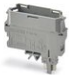
Component connector, for installing components that can be individually selected up to a diameter of 10 mm and power dissipation of up to 1 W, nominal current: 10 A, length: 41.2 mm, width: 12.3 mm, height: 37.5 mm, number of positions: 1, color: gray

Component connector - P-CO XL SKN - 3036798